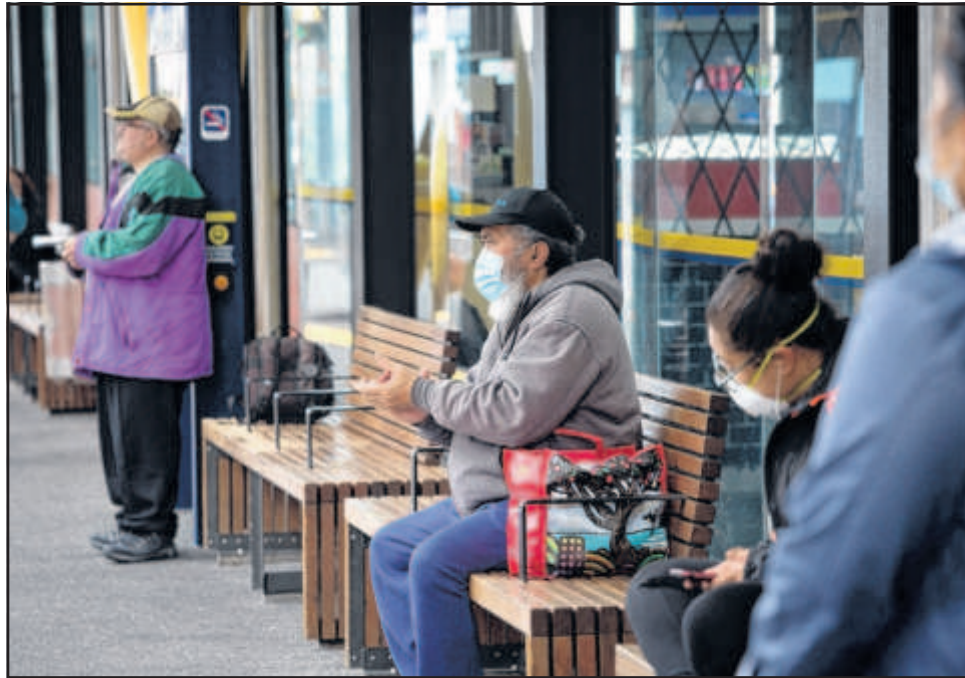
MANDATORY MASKS: Bus and taxi drivers are concerned some clients will fail to comply with the mask rules which come into effect next week.

Its health spokesperson Shane Reti said the scientific advice about mask