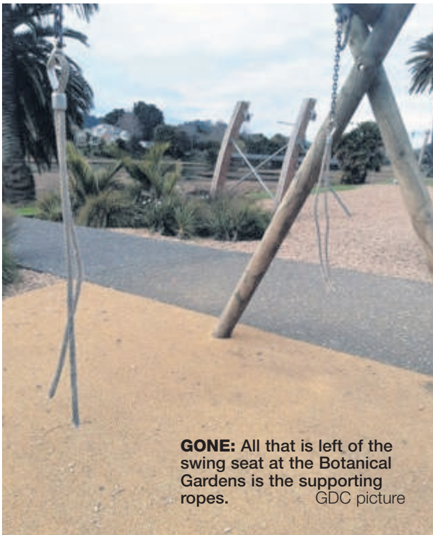
GONE: All that is left of the swing seat at the Botanical Gardens is the supporting ropes.

Eighteen volunteers helped Merv and Sue Goodley pick and bunch daffodils together in a final push to get the flowers across the East Coast before Friday's Daffodil Day.