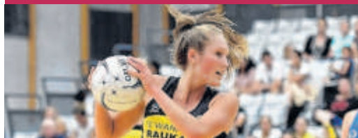
Rising Pulse star in Ferns squad