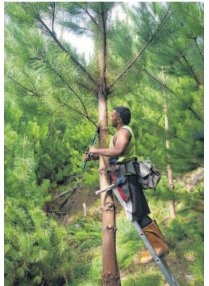
BENEFICIAL FOREST: Pruning is an important part of Ernslaw’s forest management strategy, as seen here with recent pruning in Waiiau Forest near Tolaga Bay.

Next time you find yourself in a conversation on our