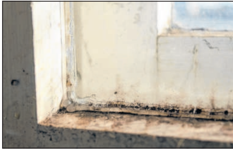
MOULD PROBLEM: Mum-of-three Georgina Matautu has won a Tenancy Tribunal dispute after black mould covered surfaces in four rooms of her one-bedroom South Auckland unit. File picture

paint off the wall and photographs were produced showing mould growth coming up through the paintwork.