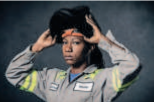
Tough as Nails 7.30pm on Prime