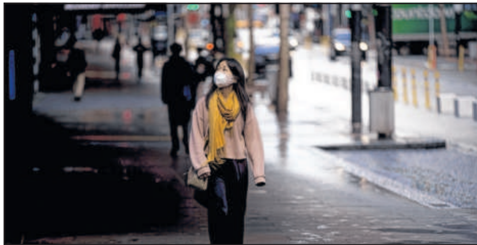
CHANGING EMOTIONS: Kiwis are feeling angry and fearful and the sense of community has dissipated during this lockdown.