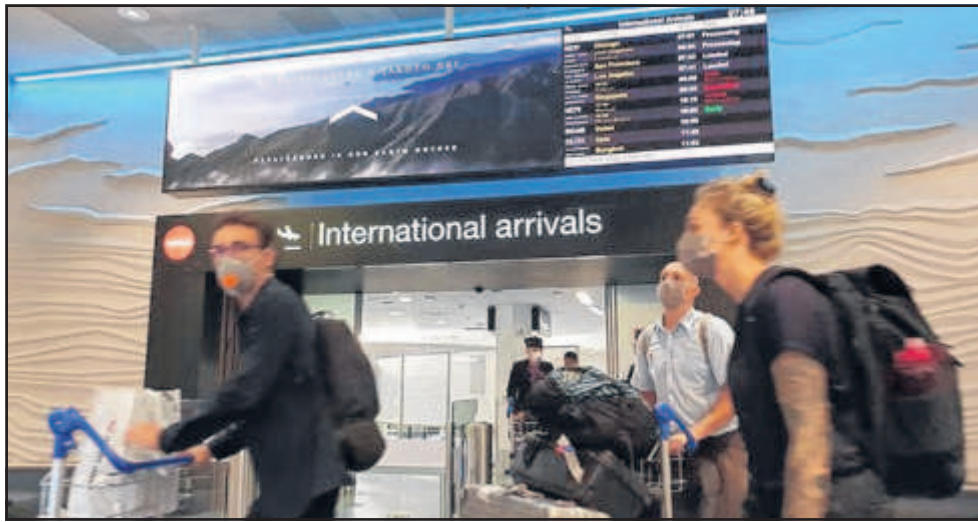
SURGE IN FOREIGN INVESTORS: Investor visa numbers have soared in New Zealand since the Covid-19 outbreak, as wealthy Americans seek out a safe haven.

"We're only after certain types of investment — we say the investment's got to be good for New Zealand not just good for the investor, and by that I mean how real is it, does it create jobs for New Zealanders, does it bring capability networks, technology, or does it provide access to new markets?"