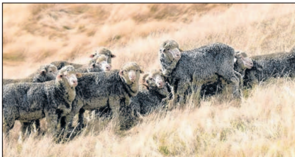
QUALITY FLEECE: The New Zealand Merino Company says consumers are looking for natural products.

Traditional suiting markets had been hit but consumers still wanted natural