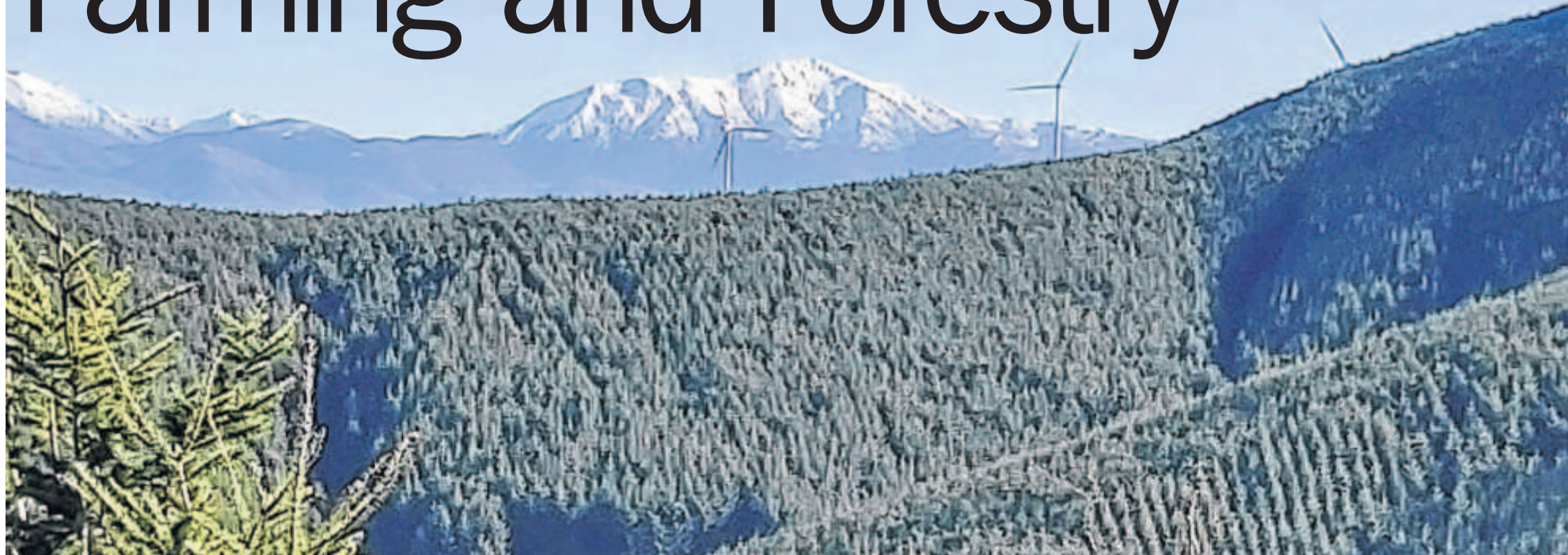
A view over Ernslaw's Barnhill Forest (Southland) looking towards the Eyre Mountains comprises Douglas-fir.

The Emissions Trading Scheme allows foresters or farm foresters to gain income from trees as they mature.