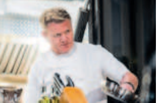
Gordon Ramsay's 24Hrs to Hell and Back, 8.30pm on TVNZ 1

5pm Pipi Ma 5.05 Takaro Tribe 5.20 Kia Mau 5.30 Takoha 5.40 Te Nutube 5.50 ZooMoo 6pm Kai Safari 6.30 Te Ao Marama 7.30 The Outliers 8pm Ahikaroa M 8.30 Circuit M 9.30 Taringa 10.20 Senior Kapa Haka Regionals 10.50 Whakatauki 11.20 Te Kauta 11.50 Closedown THURSDAY 6.30 Pipi Ma 6.35 Takaro Tribe 6.50 Kia Mau 7am Te Ao Tapatahi 8am Takoha 8.10 Te Nutube 8.20 ZooMoo 8.30 Darwin + Newts 8.40 Purakau 8.50 Paia 9am Traditional Kai 9.30 Opaki 10am Wairua 10.30 Tangaroa With Pio 11am Nga Tangata Taumata Rau Noon Pukuhohe 12.30 Matau 1pm Nga Pari Karangaranga O Te Motu 1.30 Ako 2pm Toku Reo 3pm Korero Mai 3.30 Pukuhohe 4pm Te Mana Kuratahi 4.30 Matika 5pm Pipi Ma 5.05 Takaro Tribe 5.20 Kia Mau 5.30 Takoha 5.40 Te Nutube 5.50 ZooMoo