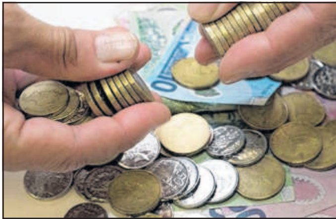
COMING TO AN END: Bonus Bonds was launched by the government in 1970 and initially run through the Post Office.

Last year the Herald reported that bonus bonds were in the sights of the financial watchdog the Financial Markets Authority as part of its work around legacy products that may