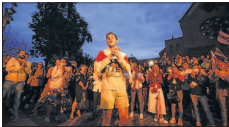
UNREST CONTINUES: Belarusian opposition supporters gather at Independence Square in Minsk, Belarus. Authorities are placing steadily mounting pressure on protesters who are pushing for the resignation of the country's authoritarian leader.