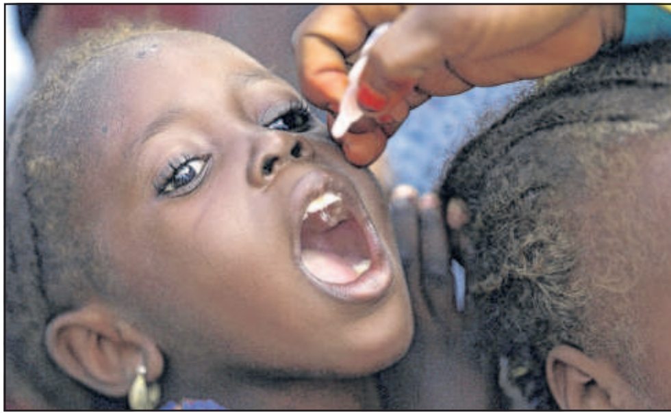
NO MORE CRIPPLING: In this file photo, a health official administers a polio vaccine to a child at a camp in Maiduguri, Nigeria. Health authorities on Tuesday declared the African continent free of the wild poliovirus after decades of effort.

But sometimes patchy surveillance across the vast continent of 1.3 billion people raises the possibility that scattered