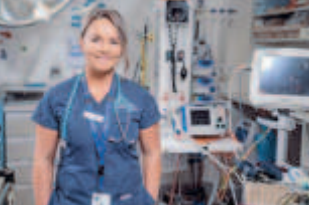
Emergency 8.30pm on Three