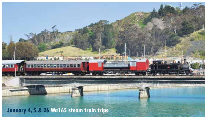
January 4, 5 & 26 Wa165 steam train trips

Live auctions, entertainment and a photography exhibition with a focus on men's mental health and suicide prevention. Fundraiser for the Movember NZ charity. Ashwood Lounge, The Poverty Bay Turf Club, Makaraka Racecourse, 76A Main Rd, 6.30-11.30pm, doors open 6.30pm, starts 7.30pm, R18. Tickets: $50, Grant Bros, 69 Gladstone Rd