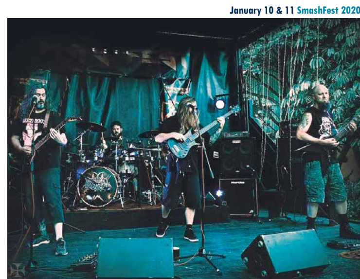
January 10 & 11 SmashFest 2020